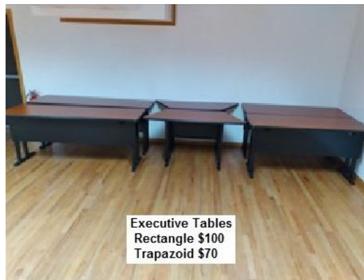
Executive Tables Rectangle $100 Trapezoid $70