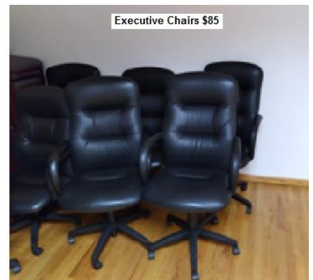
Executive Chairs $85