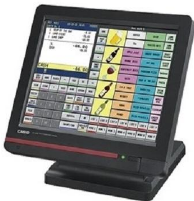
Casio QT-6600 POS $1500

If you need or know someone who may need this bar or office type equipment, call our Post number 412-901-0137 and leave a message or send an e-mail to our website usa@alpost712pa.org and someone will contact you.