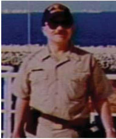
Feb., 1991 at Al Jubail, Saudia Arabia

Initially our orders were to proceed through the Strait of Hormuz, exit the Gulf, rendezvous with the approaching amphibious task group in the Arabian Sea and re-enter the Gulf in company with the task group. However, those orders changed, and we were to return to the UAE, and rendezvous with the task force after it entered the Gulf. This is when it got a bit interesting for us. Some members of my unit were topside, installing our communications antennas and connecting our communications equipment, when the Marines onboard, carrying their weapons, began taking positions along the starboard side of the ship. The gunnery sergeant in charge of the Marine unit, politely and professionally, asked me to suspend our equipment installation efforts and take my unit back inside the skin of the ship. So I, with two of my sailors, climbed down the nearest ladder, and I undogged the nearest door and led my men inside.....a fan room! (Okay, so I didn't remember the layout of the ship as well as I thought I had). From the confines of that fan room I heard the sound of a single shot and nothing else. After the passage of a few more minutes, we