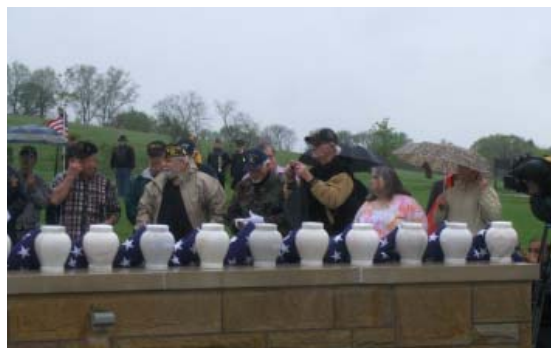
Missing in America Ceremony at the Cemetery of the Alleghenies Post 712 was very well represented